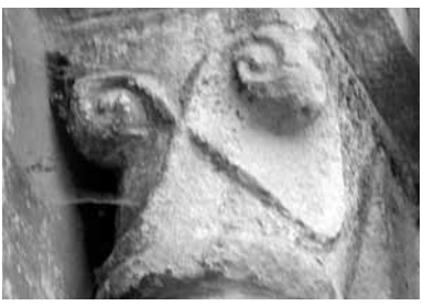
Parnes apse window

One other carver placed a geometric field along the bottom, and the other cut the cone into facets and incised parallel lines across them. The X Master was the most inspired of this group.