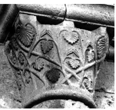
Saint-Loup-de-Naud west porch

Some show more skill than others. All are very experimental.