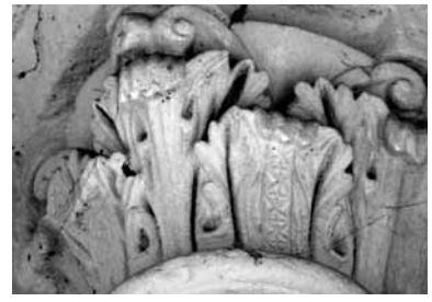
Santeuil (Val-d'Oise) crossing