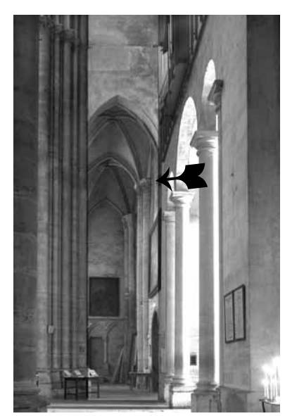
Lagny west wall of choir