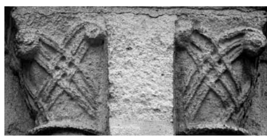
Auvers-sur-Oise north chapel window

The idea of doubling the strands and weaving them through each other may have first appears in the Auvers north chapel, and a little later in the tower of Deuil-le-Barre. Santeuil is only 15 kilometres from Auvers, and Deuil another 15 further on. The edges are irregular, the decoration is varied as are the terminals. Are the upper stories of the tower at Deuil before or after the nave? There are no constructional reasons for either, but the capital is more sophisticated and exact in its outlines. There is no clear evolutionary line, though an improvement in finish and precision.