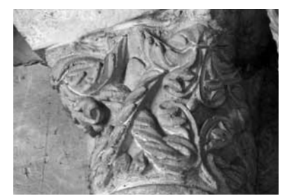
Lagny-sur-Marne west wall of choir