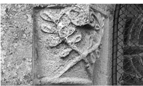
Rhuis south chapel window capital, and vault