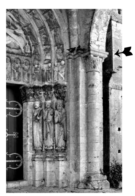
Saint-Loup-de-Naud west porch