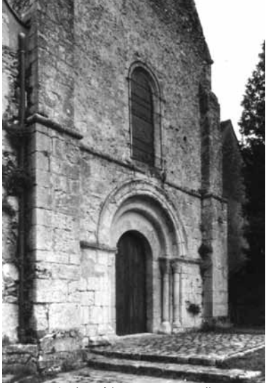
Saint-Martin-de-Bréthencourt west wall

The western door of Saint-Martin-de-Bréthencourt has pairs of capitals on either side, one on each side having crossed strands incised with crude lines as on a rope. On the left carefully outlined leaves occupy the spaces between the strands [b1]. The similar design on the right is less well carved and more geometric in its detailing [b2]. Next to each are capitals I have already ascribed to the SS Master, carved some time before similar work on the Villers-Saint-Paul nave and Mogneville north chapel. More recent investigation of the capitals in these two churches situated Villers just after the Crusade around 1102 and Mogneville into the campaign of phase 4 around 1113. To place Saint-Martin before the Crusade would therefore be reasonable.