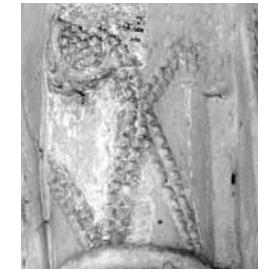
Fleury-en-Bière crossing, right

At Auvers-sur-Oise the lower courses of the apse and the north chapel were laid down together. The chapel was completed, but as with Santeuil the rest of the apse had to wait until the Crusaders returned.