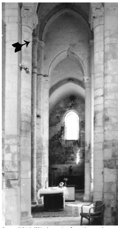
Santeuil (Val-d'Oise) crossing from the south

The use of hanging berries in the Atrechy apse follows a similar path, with an increasing complexity in the way the straps are paired and weave through each other [b3]. Each pair continues in a clever way into the coil of the crocket. There is an additional strap hanging across the basket that intersects the others exactly under the corner berries.