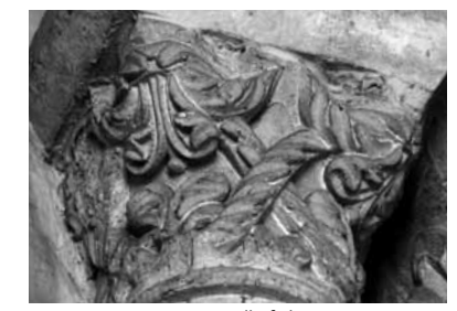
Lagny-sur-Marne west wall of choir

The capital in the remains of the tall west wall at Lagny-sur-Marne seems to belong to this group, and may be the last. The hatching has been turned into tiny leaves covering the whole length of the straps [b]. It is the most complex of all the strap designs in this group, and may have been in the later 1120s. It is on an extremely tall wall [> r]. The adjacent capitals reflect work in the Saint-Denis narthex from this time, and the carver seems to have been influenced by the richly decorated designs being employed in many places at that time.