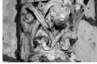
Châteaudun, Sainte-Madeleine dado