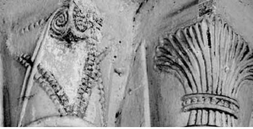
Fleury-en-Bière crossing, left face