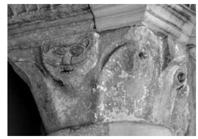
Louvres, Saint-Reuil tower base