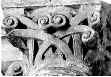
Blois, Saint-Laumer from the 1140s

These are the only strap-like designs in the Paris Basin until the mid-1130s. There is a gap in time that appears as a complete break in continuity. The next generation of strap designs are more complex with many levels of intersecting bands. The use of foliage to add to the interest on the surface was rejected, and instead men pursued cleverness in the arrangements [r].